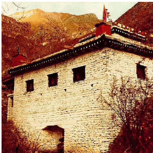
The "Temple Of Miraculous Fire" at Muktinath, Nepal. Photo by Ken Street (Nov. 1979).

[For more on this subject, please read our tract The Temple Of Miraculous Fire .]